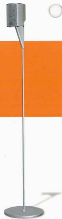
FS 300, Optional tower stand for use with the satellites of DSC 1000, SCS 140, SCS 146 and ESC 360.

That's why it makes sense to bring the JBL experience home. And that's why the professionals at JBL designed the ESC and SCS solutions for your listening and viewing pleasure.